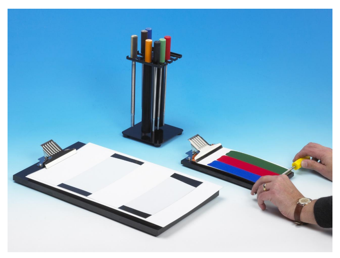
Small K Hand Coater with cleaning/storage rack. Three liquid inks being applied simultaneously. Also shown, Large K Hand Coater with a contrast test card.

The K Hand Coater provides a simple but effective means of applying paints, printing inks, lacquers, adhesives and other surface coatings onto many substrates including paper, board, plastic films, foils, metal plates, glass plates, wood etc. Two or more coatings can be applied side-by-side in a single operation making the system ideal for comparing products.